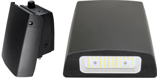
DIMENSIONS: 15W, 20W & 29W: