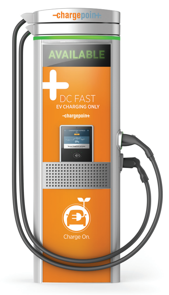
Express 250 Station