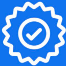
Filter Replacement Indicator | Replacement Filter ASIN B07VF25QJ6. 110 Volt units, USA registered Lifetime Warranty