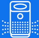
3 Fans Speeds | Night Light | Sleep Mode