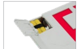
Tool-less hinged door for easy and safe access to isolated low voltage battery compartment. Only available with G2-NI option.