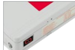
Numeric Indicator for dependable visual status and fault detection. Only available with G2-NI option.