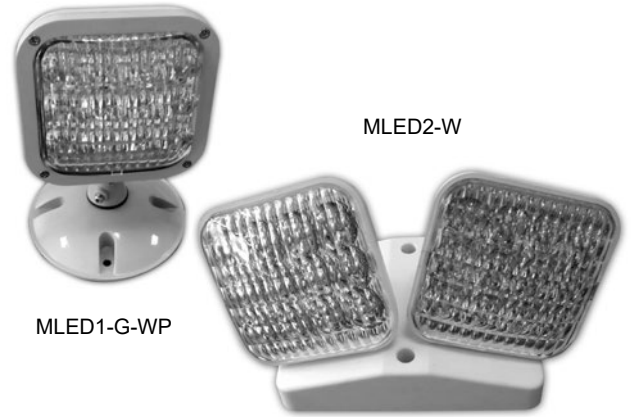
Includes Mounting Plate