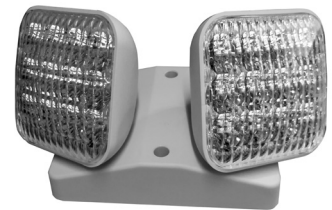
Double lamp with No Options